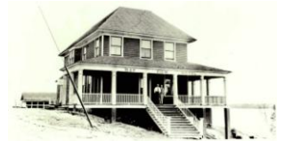
Bayview Hotel, Bruce Mines, On

Looking for a place to stay in Bruce Mines...in the early 1900's ??