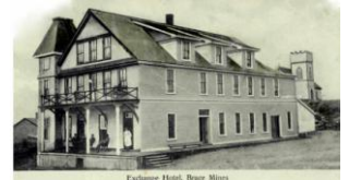
Exchange Hotel...Bruce Mines, On..